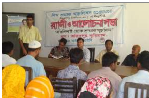
Observation of World No Tobacco Day 2010 at Rajibpur