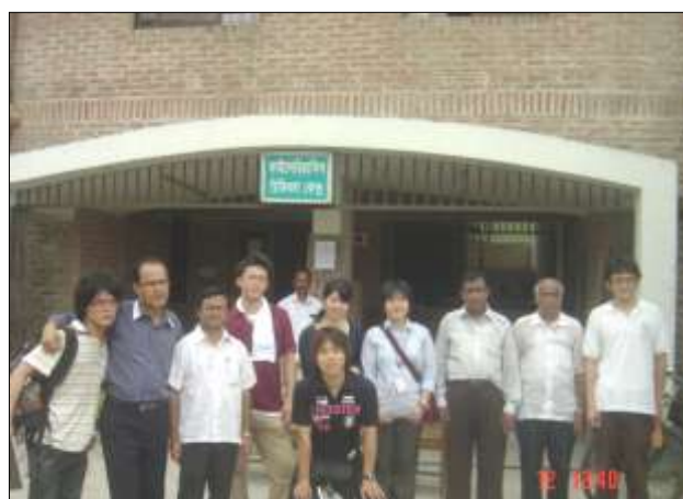
In front of filaria Hospital a Japanese Medical student team with IACIB Executive Director