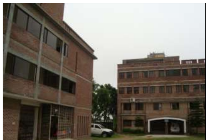
Filaria Hospital, Syedpur, Nilphamari