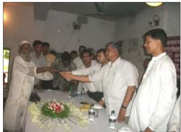
Md. Motahar Hossain M.P Honorable state Minister Primary & Mass Education distribute cheque to the poultry farmer at Patgram, Lalmonirhat

IACIB has been working on Avian Influenza in human with support from Directorate of Health Services and also working with Ministry of Fisheries and Livestock on poultry sector under Rajshahi Division. A project titled “Strengthening of support services for combating Avian Influenza (HPAI) in Bangladesh is ongoing since April 2010 with support from Ministry of Fisheries and Livestock at Nilphamari, Dinazpur, Lalmonirhat, Kurigram, Gaibanda and Panchagar. IACIB has been directly implementing the program in 3 districts and as consortium leader in other 3 districts with Moytree Bangladesh and SKBUS.