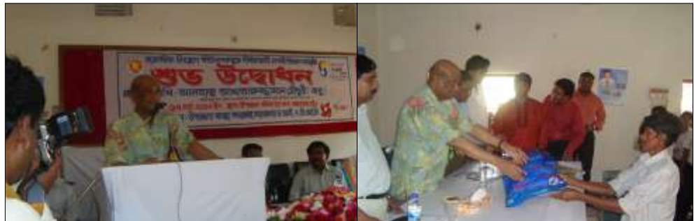
Alhaj Akthruzzaman Chaudhuri (Babu), Hon'ble M.P opening the LLIN distribution ceremony at Anwara, C.S Chittagonj, UNO, UH&FPO, other officer and local elites attended the ceremony

Diagnosis and treatment services are delivered by the health workers through community based services. IEC materials are distributed and used regularly during health