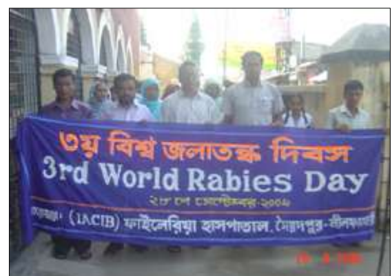
3 rd World Rabies Day observation at Syedpur

IACIB is a member of Bangladesh Anti Rabies Alliance (BARA) and has been working as a coordinator of BARA. IACIB has also observed 3 rd World Rabies Day on 28 September 2009 at Syedpur, Nilphamari. As a coordinator of BARA IACIB is a member of Technical Working Group (TWG) for National Rabies Control constituted by Ministry of LGRD in May 2010. IACIB has taken active role in development of National Guideline and